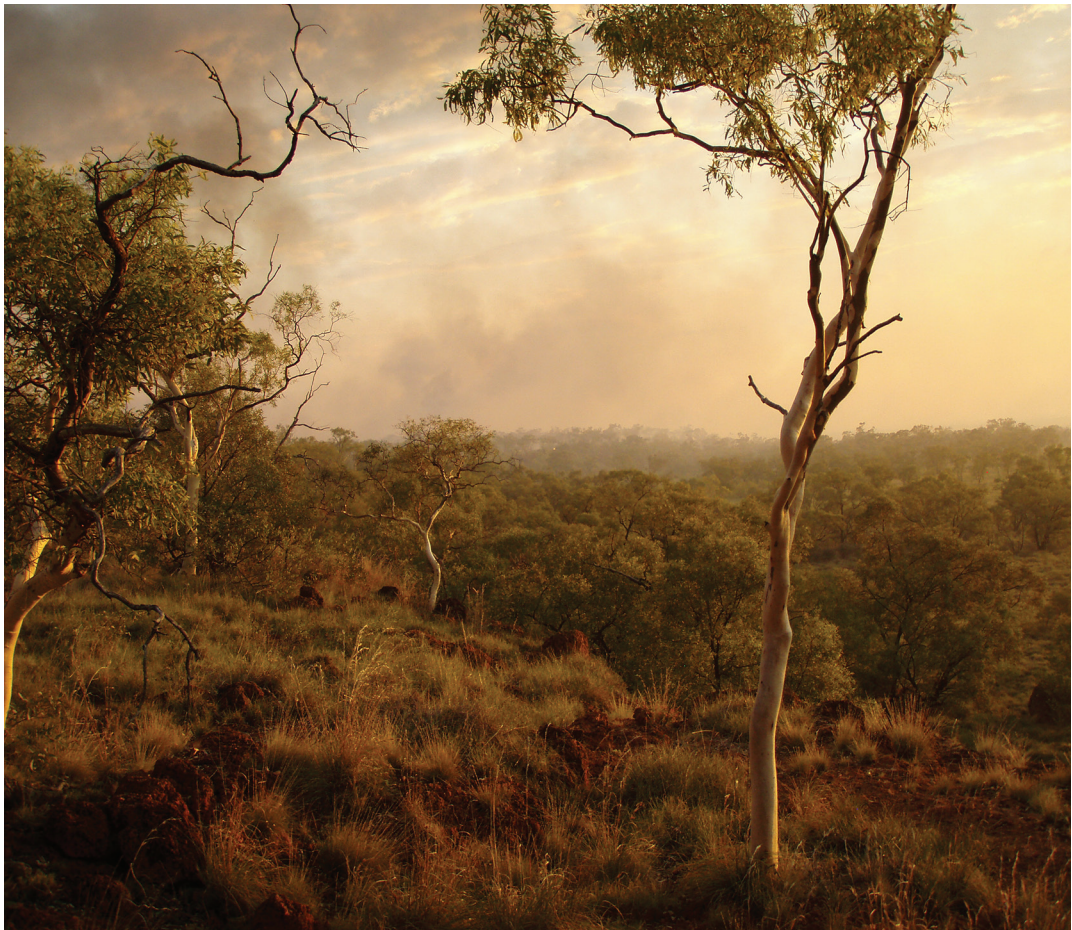
Rain over the Desert Uplands.

Note: All information herein comes from published sources – no research was conducted by the author.