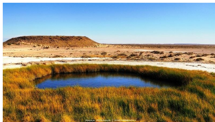
Blanche Cup ( Thirka) with extinct mound spring Hamilton Hill ( Wabma-kardayapu) in background. This area is the site of an Aboriginal Dreaming story relating to the Rainbow Serpent Kanmari